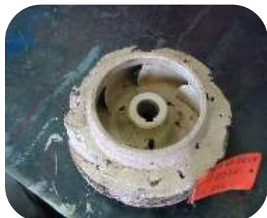
Impeller from a sea water pump was badly eroded. The pump was obsolete and no spare parts were available. The surface of the impeller was rebuilt using 301 Epoxy Resin with glass fillers and then machined to a smooth finish. Once cured 2 coats of 202 Ceramic Repair Fluid were applied to complete the repair