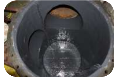
Sea water filter was in need of urgent repair. The internal surfaces were abrasive blast cleaned and lined with 2 coats of 202 Ceramic Repair Fluid. The coating was then post cured at 50C for 6 hrs to ensure the filter was back in operation within 24 hrs.

The product can be used to rebuild damaged or worn surfaces on equipment such as -