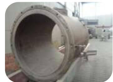
Process vessel required rebuilding and resurfacing. Internal substrates were mechanically abraded and relined using 202 Ceramic Repair Fluid